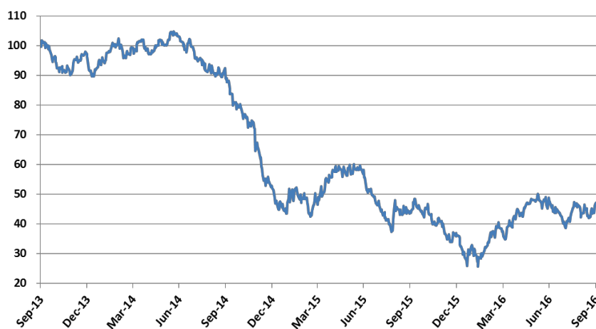
West Texas Oil (WTI) Prices (September 2013 = 100)

“Moreover, a number of industries that are vital for the products we distribute remain locked in a deflationary and recessionary environment. We at long last observed a firming of oil prices, which increased 7% between 3Q15 and 3Q16, rising from USD45.09 to USD48.24 per barrel. Nevertheless, we are yet to perceive any significant or broad firming of oil derivative prices.